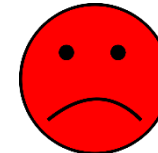
Red – Severe flare (not settling with Amber treatment)