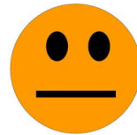
Amber – Mild flare