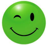
Green – Eczema clear